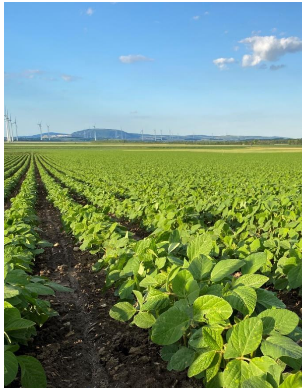
Soya field in the vicinity of Vienna

In 2019, soybean imports into the EU amounted to almost 40 million tonnes, mainly from overseas. About 12 million hectares are needed to meet this demand. According to the Sustainable Trade Initiative (IDH), only 25% of the EU's soya demand comes from certified deforestation-free production. [7] The regional farmers association "Bäuerliche Erzeugergemeinschaft Schwäbisch Hall" is a pioneer and relies on regional and deforestation-free feed: Swabian-Hall swines eat regional feed such as barley, wheat and grain maize, and the critical soya meal comes from regional or European production. Since 2016, Swabian-Hall swines have been fed mainly Donau Soja / Europe Soya-certified feed as protein feed. The organic Swabian-Hall swines eat the farm's own/regional feed such as barley, triticale, peas, wheat and soya beans or soya cake instead of soya meal.