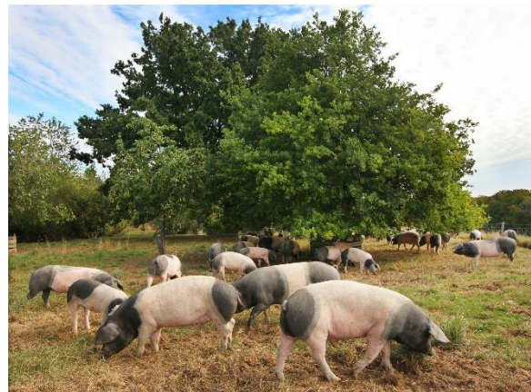
Swabian-Hall swines receive Donau Soja / Europe Soya-certified feed and the farm's own organic feed, respectively.

With our diet, we contribute significantly to the climate crisis. Especially the production of animal proteins causes considerable amounts of greenhouse gas emissions. [2] In the case of pork, this is mainly due to the production of feed, especially soya from overseas: the European Union is heavily dependent on soya imports and obtains about 40% of its soya demand from Brazil. This means that we not only import feed, but also the environmental damage associated with it, such as deforestation for soya cultivation. After all, one third of the deforestation imported into the EU is due to the protein-rich legume. Soya thus accounts for the largest share of deforestation associated with EU imports – even ahead of palm oil. [3] This is because soya cultivation is often – especially in Brazil – leading to the conversion of forests (but also grassland) into cropland, which releases large amounts of climate-effective CO 2 emissions. [4]