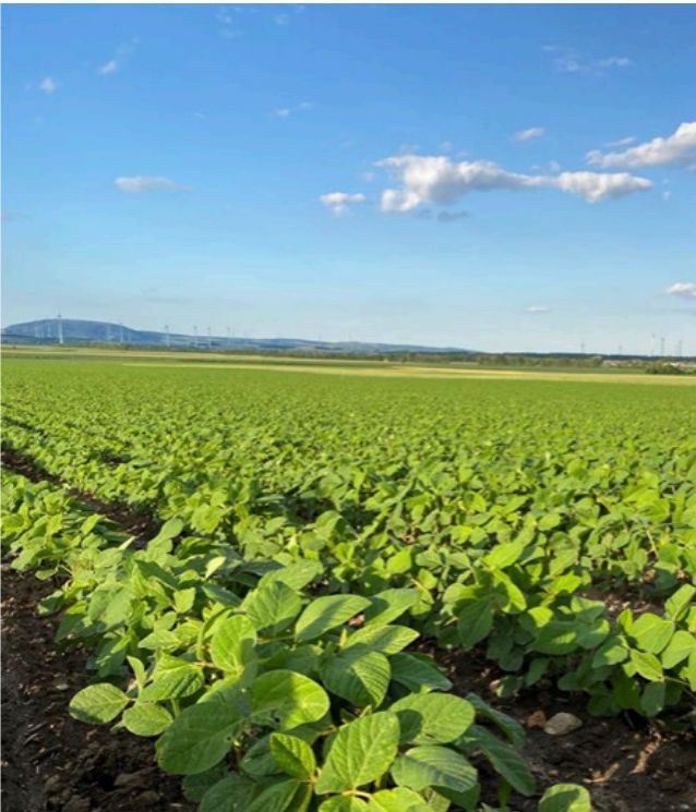
Soya field in the vicinity of Vienna

The quality labels DONAU SOJA / EUROPE SOYA guarantee non-GM, sustainably produced soya of European origin. DONAU SOJA / EUROPE SOYA-certified supply chains protect valuable ecosystems: Soya is only cultivated on land that was dedicated for agricultural use not later than 1 January 2008. By relying on DONAU SOJA / EUROPE SOYA, EDEKA actively contributes to the preservation of forests and other valuable ecosystems and thus to climate protection.