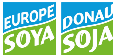
The quality labels EUROPE SOYA / DONAU SOJA stand for quality- and origin-controlled soya feed

The quality labels DONAU SOJA / EUROPE SOYA guarantee non-GM, sustainably produced soya of European origin. DONAU SOJA / EUROPE SOYA-certified supply chains protect valuable ecosystems: Soya is only cultivated on land that was dedicated for agricultural use not later than 1 January 2008. By relying on DONAU SOJA / EUROPE SOYA, EDEKA actively contributes to the preservation of forests and other valuable ecosystems and thus to climate protection.