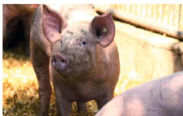
EDEKA Hofglück-pigs are fed with DONAU SOJA / EUROPE SOYA.

Brazil is the source of about 40 % of the European Union's soya imports. They are mainly used as protein-rich animal feed in livestock production. Due to land transformations, soya feed from the Amazon as or from the Cerrado is often contaminated with high CO 2 emissions and therefore has a carbon footprint about 10 times higher than that of Donau Soja / Europe Soja-certified European soya feed.