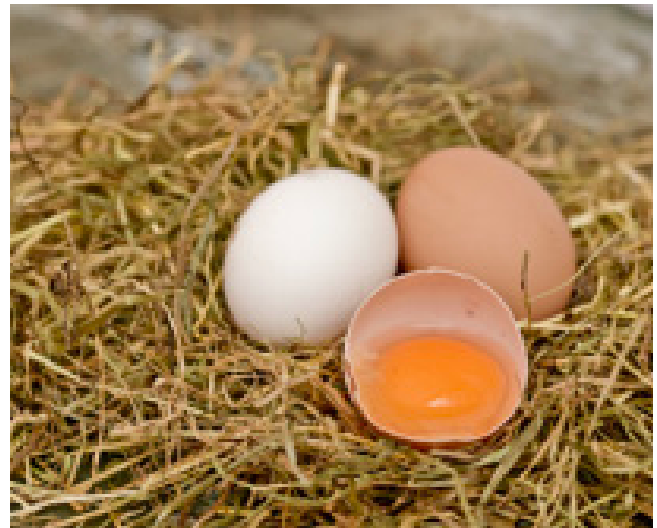
Eggs with soya from European producers

The European Union is heavily dependent on soya imports. In 2018 these amounted to almost 40 million tonnes, mainly from overseas. About 12 million hectares are needed to meet this demand – one and a half times the area of Austria! According to the Sustainable Trade Initiative (IDH), only 19% of the EU's soya consumption come from certified deforestation-free production, as guaranteed by Donau Soja. In Germany 3.6 million tons of soya are consumed annually, of which 22% come from certified deforestation-free production.